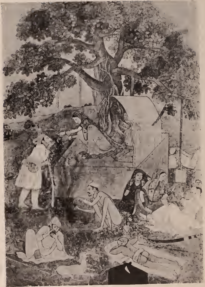
SCENE BY THE ROADSIDE, KANGRA KALM (EIGHTEENTH CENTURY).